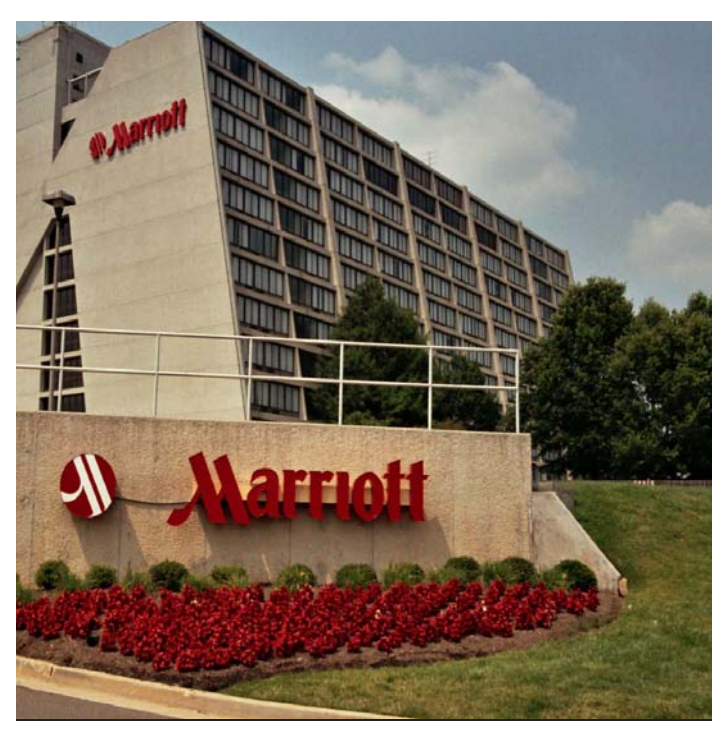
The Headquarters Marriott Hotel

Coming from the East or the West on I-40: Take the James White Parkway Exit (388) off I-40. Get into the left lane and proceed to the Hill Avenue Exit. Turn right at the light onto Hill Avenue. The Marriott entrance is just past Suntrust Bank.